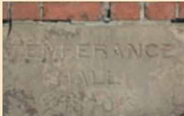
Temperance Hall sign above the post office

Immediately in front of you as you leave Hospital Lane and directly opposite the Methodist Chapel is Turnpike Cottage, originally the tollhouse for the old turnpike road to Craven Arms, the stone tiles on the roof are of interest, smaller at the top and larger at the bottom.