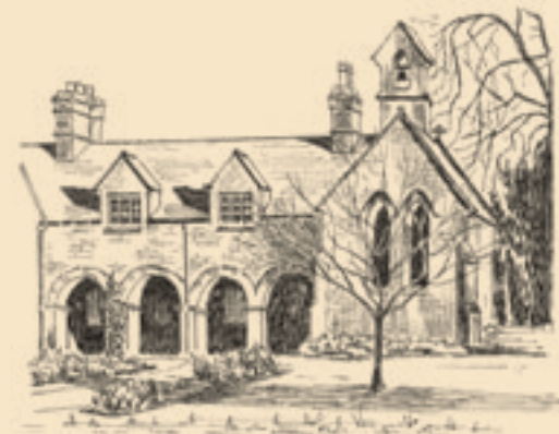
Above and below, Trinity Hospital