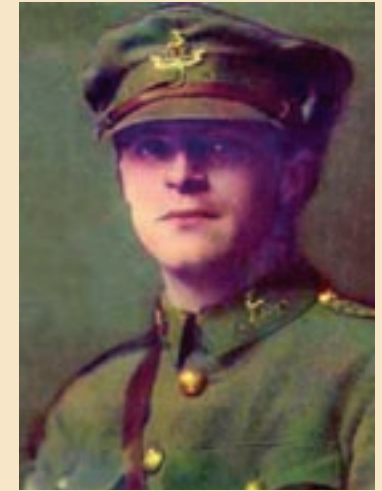
Bruce Bairnsfather creator of 'Old Bill' pictured below