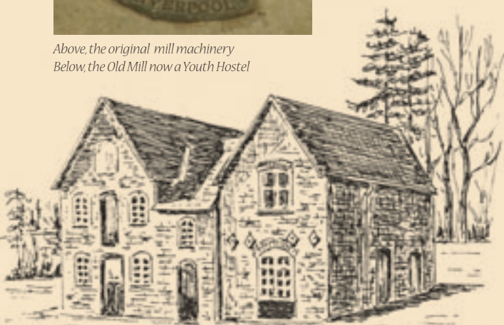
Above, the original mill machinery Below, the Old Mill now a Youth Hostel