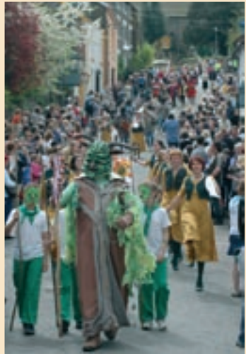
The Green Man Festival

For further and more detailed information about Clun visit the website. www.clun.org.uk