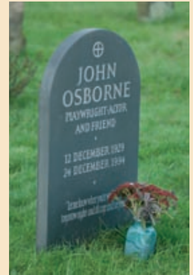
The grave of John Osborne