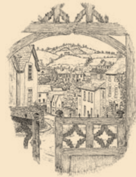
View from the lychgate down Church Street